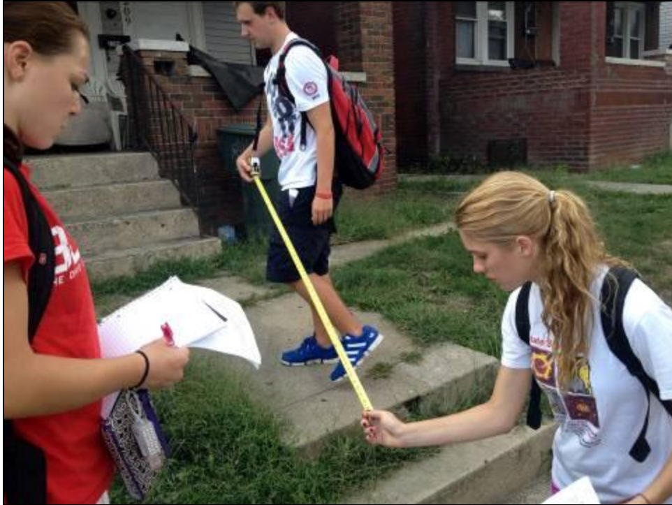
Field work: Brownfield Re-Design Charrette (Franklinton Development Corporation (non-profit organization))